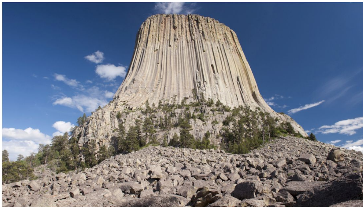
Image 1. Devils Tower in Wyoming formed when molten rock intruded into the existing rocks. Wind and water eroded the sedimentary rock surrounding the tower faster than the harder igneous rock, creating the Tower's iconic shape.

Rocks are very common. You may not think too much about them. Yet rocks are more important than you may know! They contain clues about what Earth was like long ago. Rocks can help scientists understand how our planet has changed in the past. They can also hint at the ways it may change in the future.