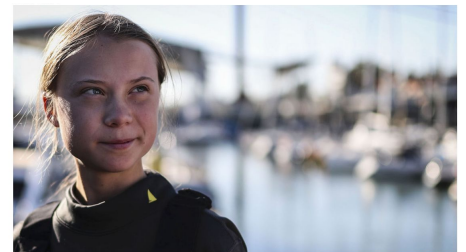
Image 1. Swedish climate activist Greta Thunberg after disembarking from the catamaran La Vagabonde at the Santo Amaro docks in Lisbon, Portugal, on December 3, 2019.

Greta Thunberg is a teenage climate activist. For more than a year, she has been leading worldwide protests. Thunberg was named Time's Person of the Year on December 11.