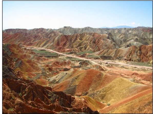
"Zhangye Danxia"

The stripes used to be hidden, stacked underground like layers in a cake. The layers formed over a very long time. In some layers, water and oxygen mixed with iron in the rock to turn it red, like rusting metal. In others, tiny amounts of different minerals 3 in the rock created colors such as green, yellow, or blue. Then, about 55 million years ago, two of the Earth's tectonic plates 4 smashed into each other in slow motion. All that rock was pushed upward to form mountains — and those colorful layers were hidden no longer.