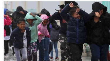
Students walk back to their bus after getting caught in heavy rain during a school excursion on the strongest storm in six years slammed Los Angeles, California, on February 17, 2017.

Watching the weather is part of daily life. Knowing if it will be sunny or rainy helps us decide what to wear. It also helps us choose what activities to do that day.